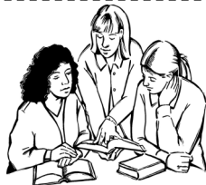
Ladies' Bible Study

Ladies Bible Study resumes Tuesday, Jan. 9 @ 9:00 a.m. in Laird Hall.